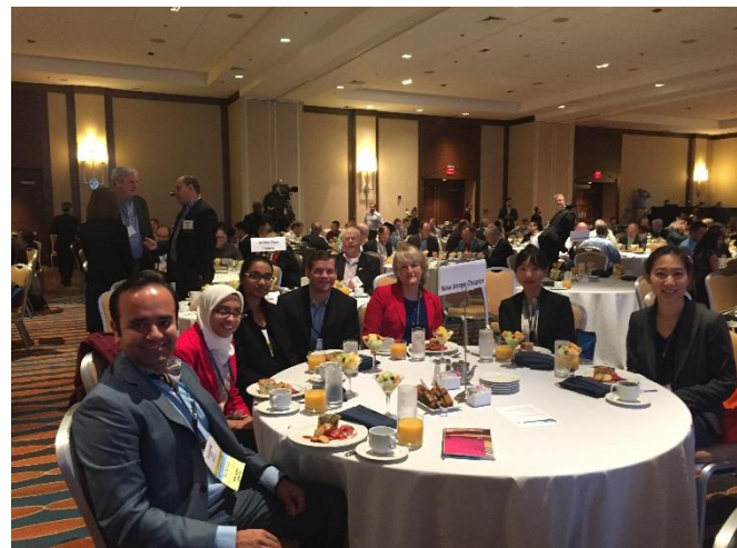
Participating NJ Chapter Students made us very proud at ISPE National Poster Contest at 2015 ISPE Annual Meeting in Philadelphia, PA!